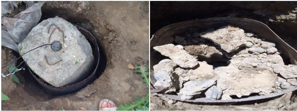
a) Monolithic concrete block, b) Monolithic concrete block is crushed by gas-generator.